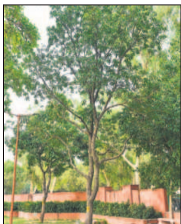
■ Mangifera Indica (Mango).