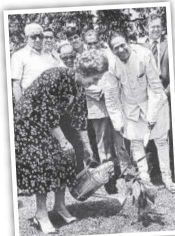
■ April 15, 1981 - Then Prime Minister of UK Margaret Thatcher.

BARACK OBAMA: President of USA – January 25, 2015