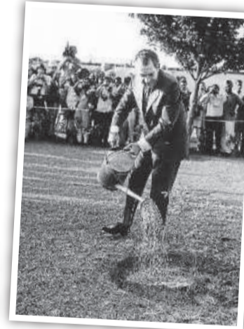
■ July 31, 1969 - Then US President Richard Nixon.