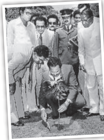
■ May 18, 1991 - Ali Nasir Muhammad, then President of South Yemen.