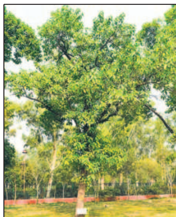
■ Anthocephalus Cadamba (Kadam).