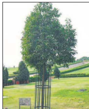
■ Mimusops Elengi (Morshali).