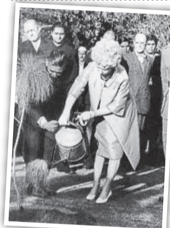
■ January 22, 1961 - Queen Elizabeth II at Rajghat.