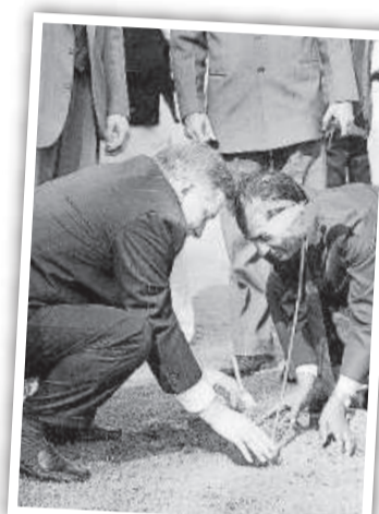
■ March 3, 1994 - Then President of Poland Lech Wałęsa.