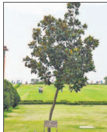
■ Magnolia Grandiflora (Him Champa).