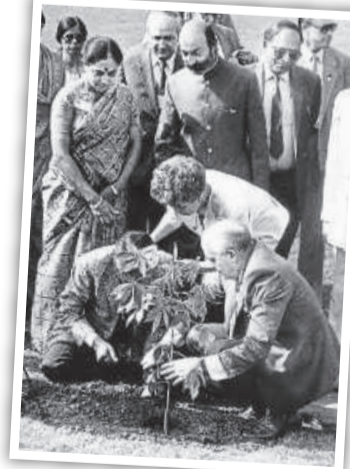
■ November 27, 1986 - Soviet leader Mikhail Gorbachev.