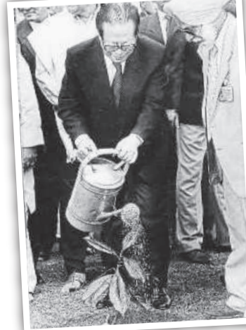
■ November 29, 1996 - Then Chinese President Jiang Zemin.