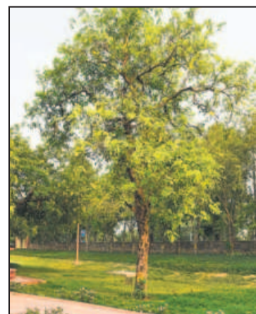
■ Cassia Fistula (Amaltas) tree.