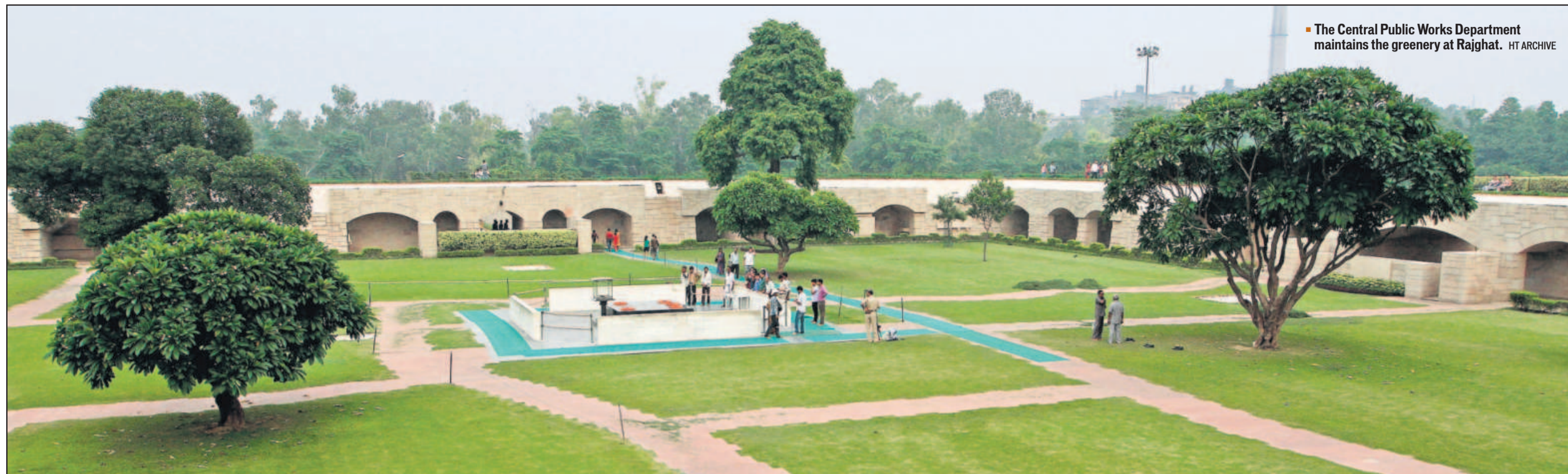
■ The Central Public Works Department maintains the greenery at Rajghat.