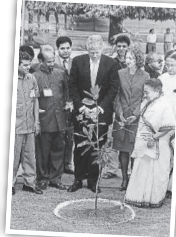
■ March 21, 2000 - Then US President Bill Clinton.