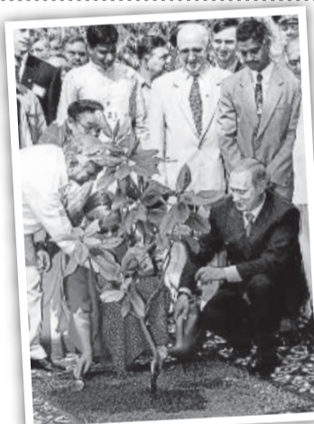
■ October 3, 2000 - President of Russia Vladimir Putin.