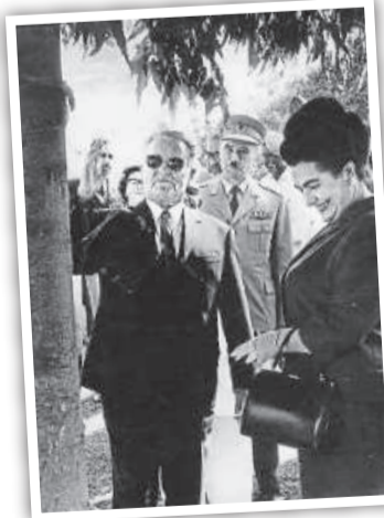
■ December 18, 1954 - Then President of Yugoslavia Josip Broz Tito.